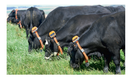
Virtual Fencing & Herding