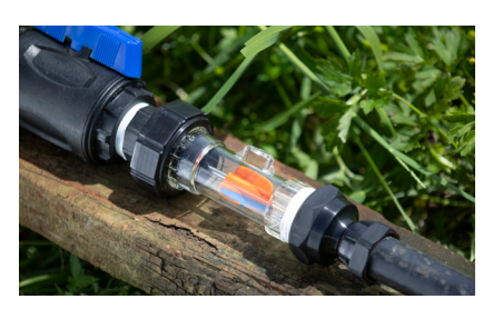
Wireless Water Monitoring