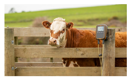
Weighing & EID