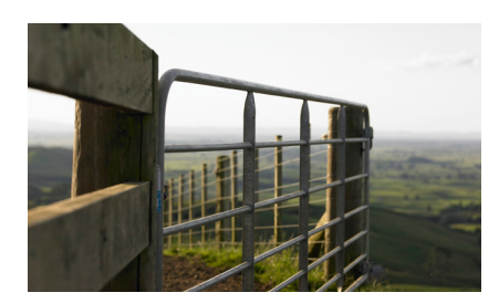
Gate & Gate Hardware