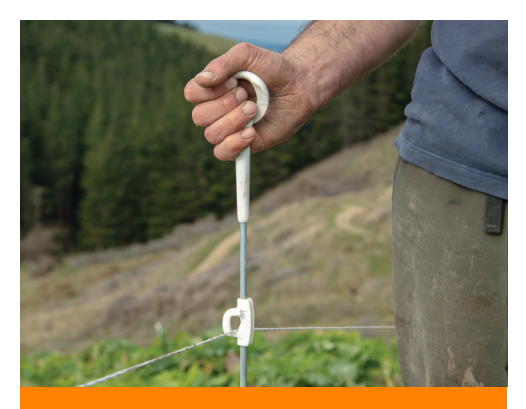
You can do it the hard way... or the Gallagher way Brilliantly simple solutions that make farm life easier and more profitable - it's what Gallagher does best.