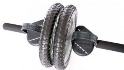
AB POWER WHEELS