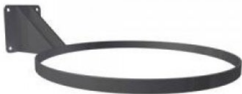
FITBALL WALL STORAGE