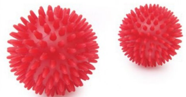
MASSAGE BALLS (ALL SIZES & STYLES)