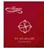
DR. NEUBAUER COSMETICS Inklusive Produkt aus der Produktlinie GLOW & GLOW