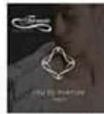
DÜFTE FÜR IHN