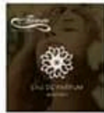
DÜFTE FÜR SIE