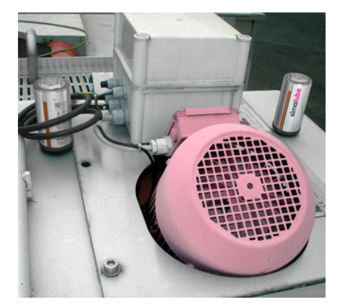
Lubricating conveyor chains with oil. The lubricators are attached to the outside of the housing. The oil is transported to the chain via a tube.