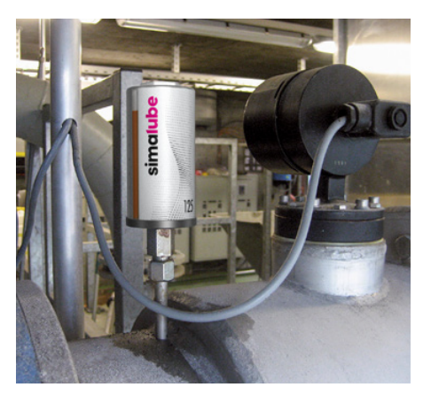
Lubricating bearings: the lubricant is transported to the bearings via a short pipe.

Lubrication of the main shaft of a wash press.