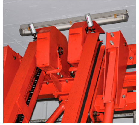
Chain lubrication with simalube on a bar screen equipped with brushes.