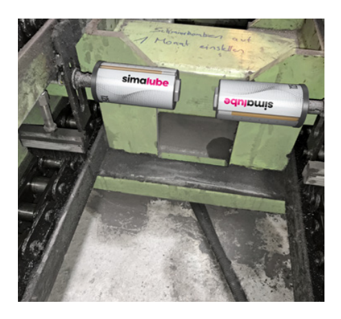
simalube lubricators, including brushes, are installed on a chain conveyor. The chains are thus continuously lubricated while being cleaned at the same time.

«Considerable time savings and improved safety at work thanks to automatic lubrication»