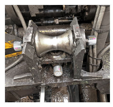
The small 30 ml simalube units lubricate the side bearings and the lifting device of the guide roller.