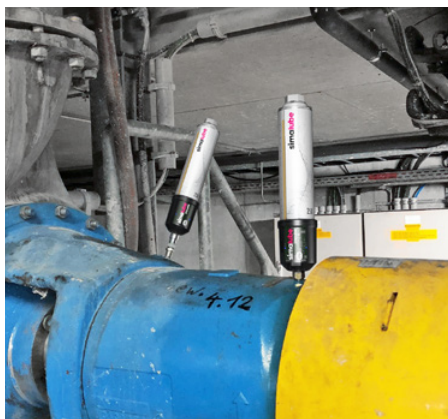
The bearings of the pump are lubricated with two IMPULSE and 250 ml simalube units.