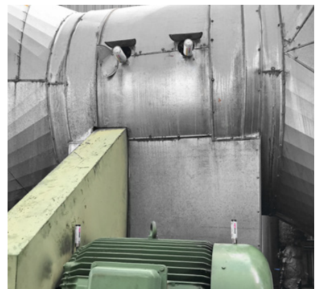
Lubrication of the bearings of a ventilation unit with 125 ml and 15 ml simalube units.