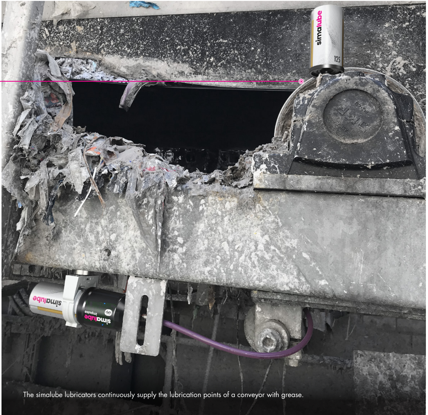
The simalube lubricators continuously supply the lubrication points of a conveyor with grease.