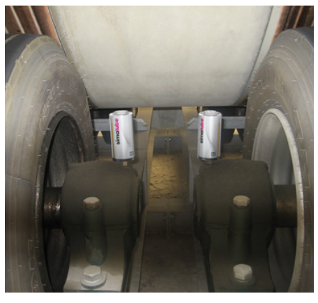
The lubricators are connected directly to the vertical bearing on the drive of a conveyor belt.