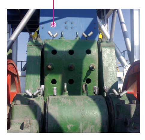
A crusher is lubricated with simalube.