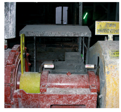
Permanent bearing lubrication on the main drive shaft of a filter pump.