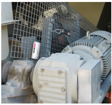
A vertical bearing on a conveyor belt is lubricated with a simalube lubricator.