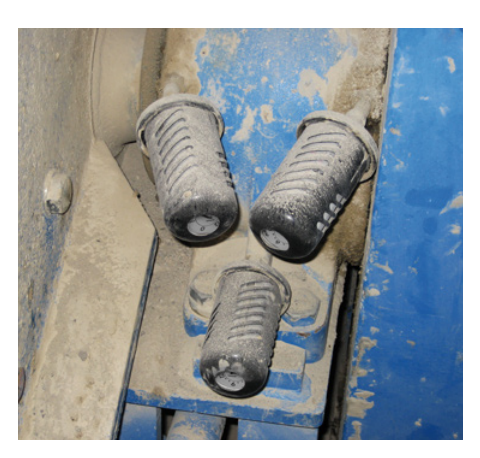
Protective caps used to prevent damage to the lubricator from harsh external conditions.