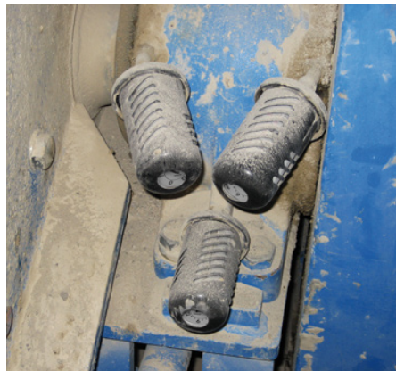
Protective caps used to prevent damage to the lubricator from harsh external conditions.