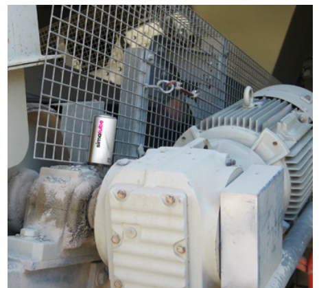
A vertical bearing on a conveyor belt is lubricated with a simalube lubricator.