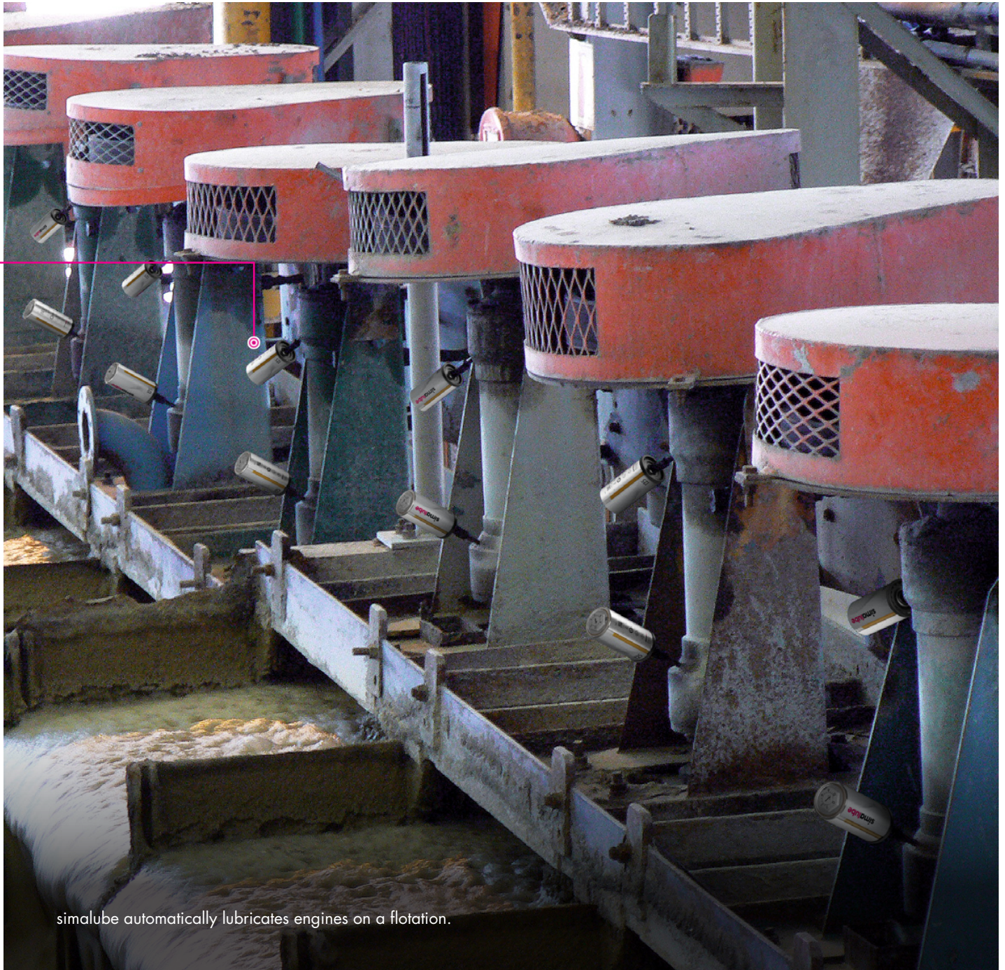
simalube automatically lubricates engines on a flotation.