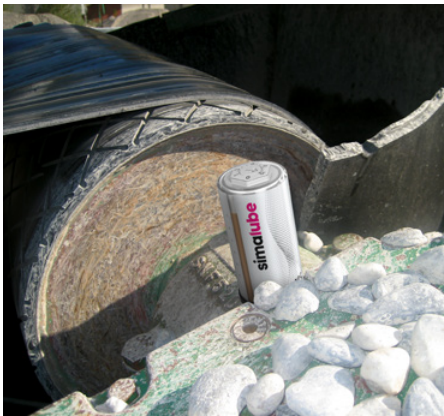
Belt drive lubricated with simalube.

«simalube reduces costs and increases safety in the workplace»