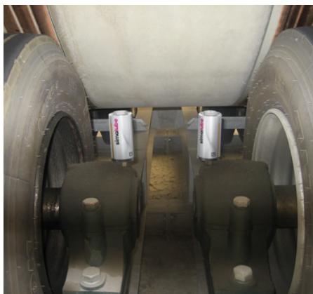
The lubricators are connected directly to the vertical bearing on the drive of a conveyor belt.