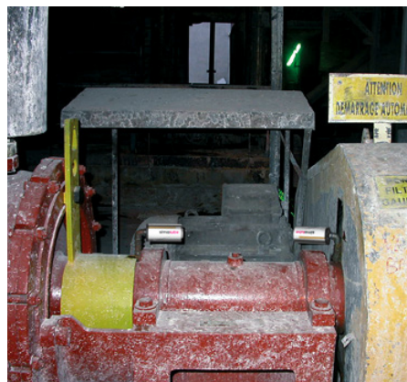
Permanent bearing lubrication on the main drive shaft of a filter pump.