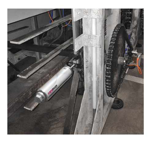
Chain lubrication with a 250 ml simalube and a flat brush.

«The food-grade lubricants of the simalube lubricator are all NSF H1-registered»