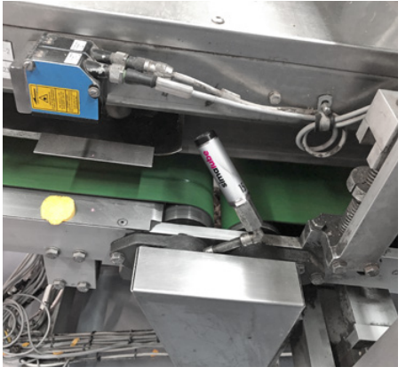
Bearing lubrication of the drive roller of a conveyor belt in the production of chips (crisps).