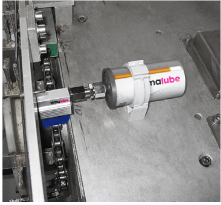
In the food industry special brushes with blue bristles are used, as they can be detected more easily by monitoring cameras.