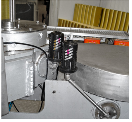
Lubrication of the rotary table of a filling unit for canned food. The lubricators are protected by a safety hood.