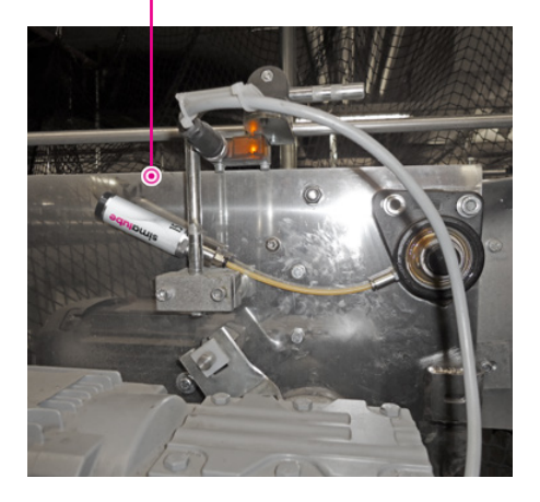
Flange bearing lubrication with a 15 ml simalube, the smallest lubricator in the world.