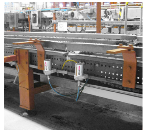
Two simalube lubricators with tube extensions lubricate a transfer chain in a brewery.