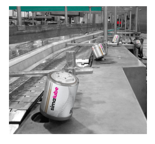
A filling line is equipped with several simalube lubricators.

«simalube lubricates continuously, extends the lifespan of the production machines and sinks maintenance costs»