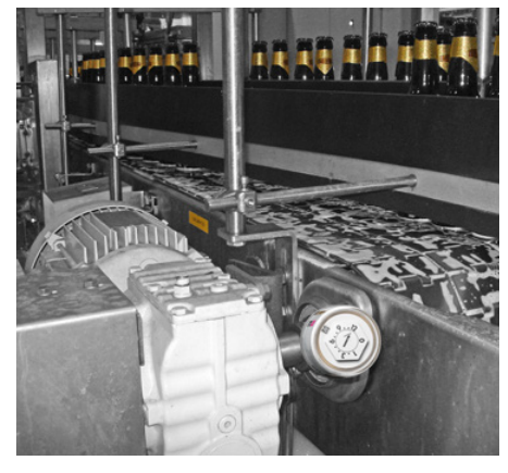
Lubrication of a transport belt with a simalube lubricator.