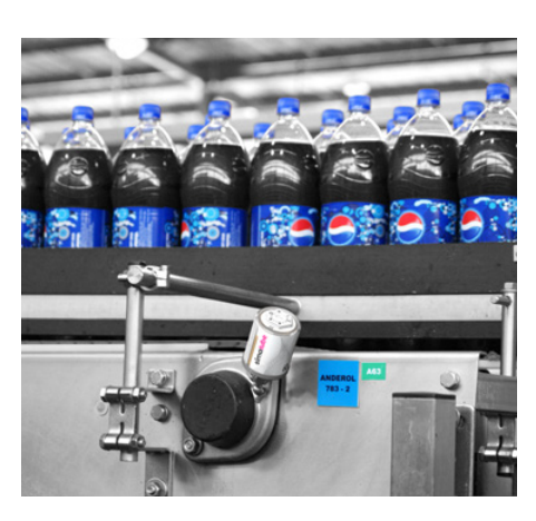
Lubrication of a flange bearing on a filling machine for soft drinks.