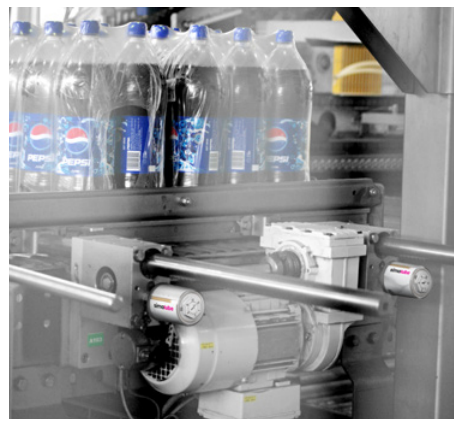
The bearing on the gear box is lubricated with two 60 ml simalube lubricators.