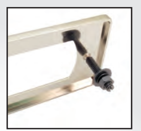
Back of cover plate with mounting hardware