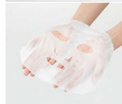
Compressed Silk Face Masks (30 tablets)