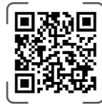
Govee Home App

Name: GOVEE MOMENTS(US) TRADING LIMITED Address: 13013 WESTERN AVE STE 5 BLUE ISLAND IL 60406-2448 Email: support@govee.com Contact information: https://www.govee.com/support