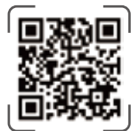
Govee Home App

For FAQs and more information, please visit: www.govee.com