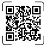
Govee Home App

For FAQs and more information, please visit: www.govee.com