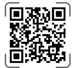
Govee Home App

For FAQs and more information, please visit: www.govee.com