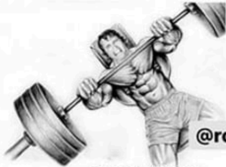
Bench Press 5 Sets x 5 reps