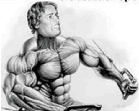
Cable Crossover 4 Sets x 12 Reps