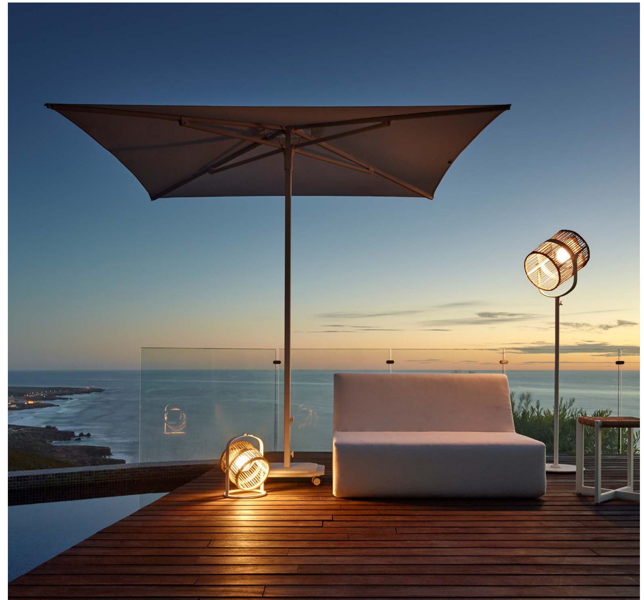
JCP.102 | 230 x 230 cm - FRAME Alu White Matte - CANOPY Natté White