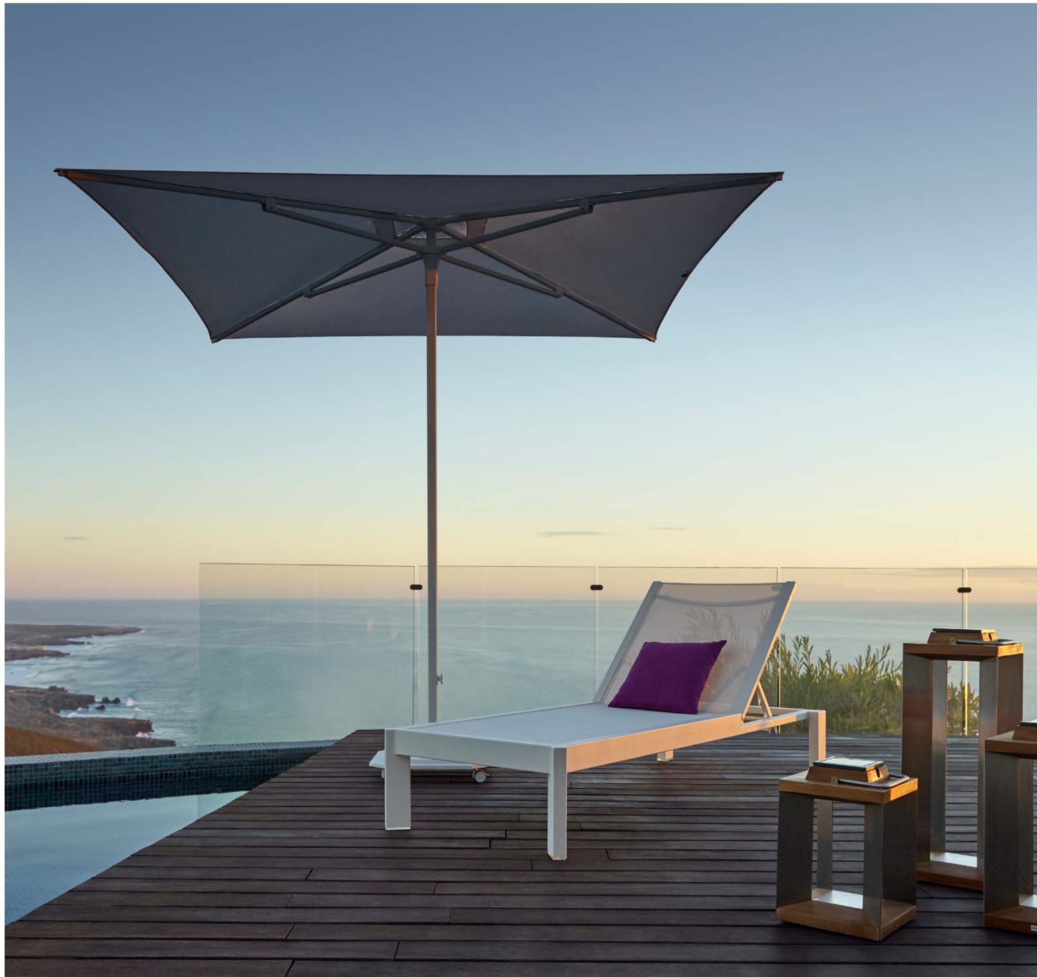
JCP.102 | 230 x 230 cm - FRAME Alu White Matte - CANOPY Natté White