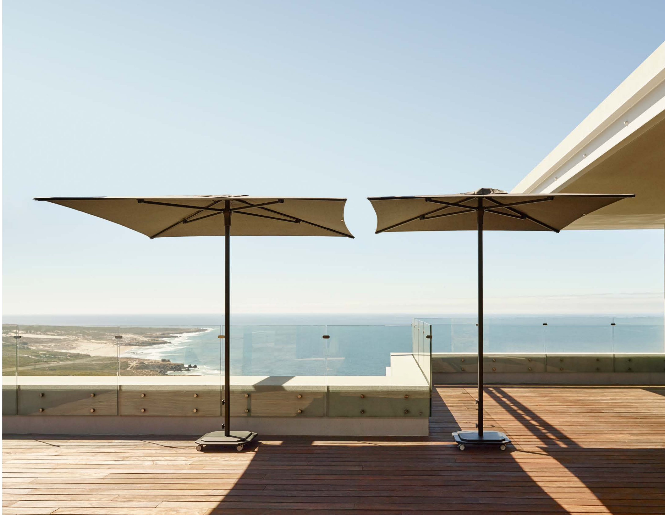
JCP.102 | 230 x 230 cm - FRAME Alu Charcoal Matte - CANOPY Natté Dark Taupe