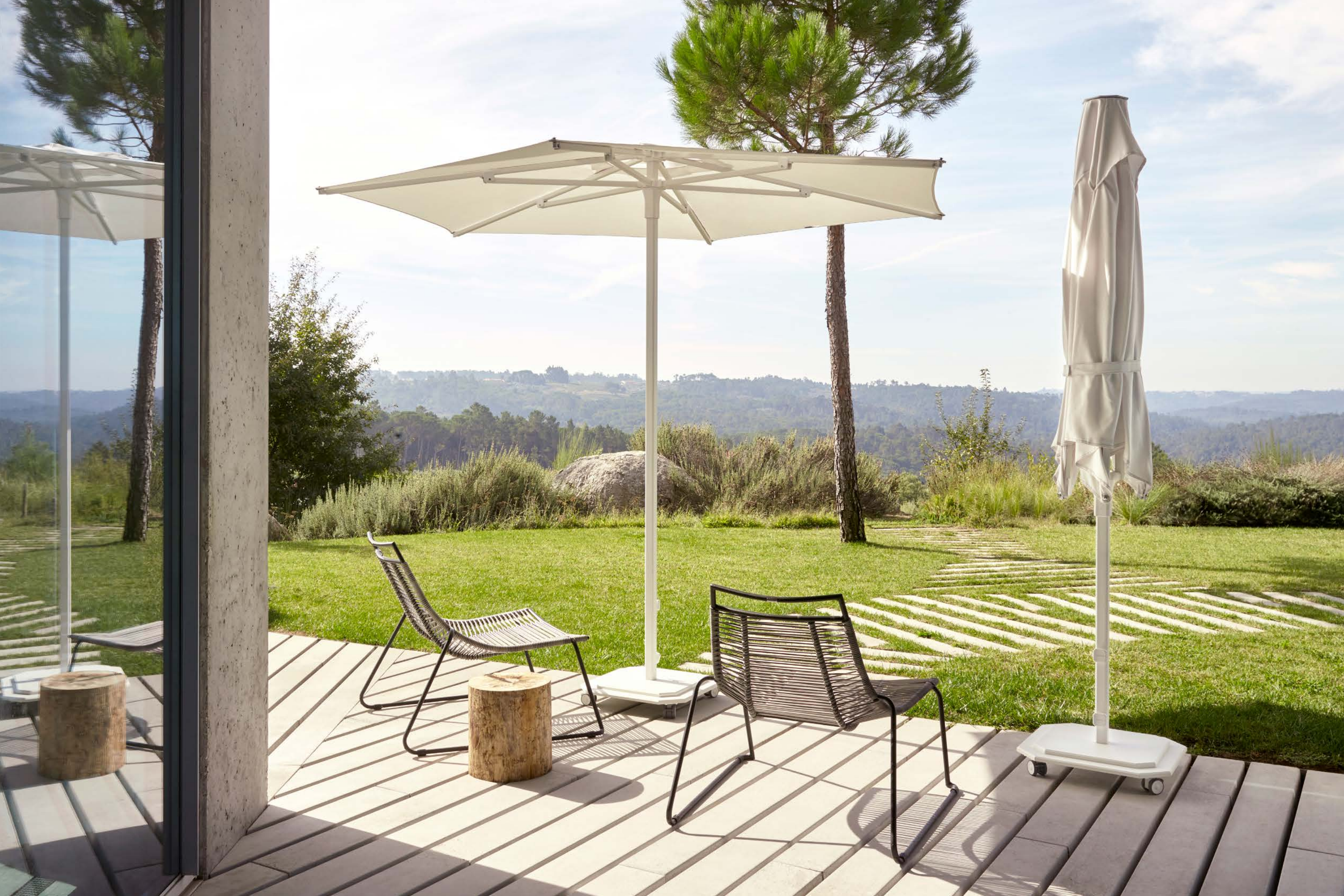
JCP.103 | ø 275 cm - FRAME Alu White Matte - CANOPY Natté White