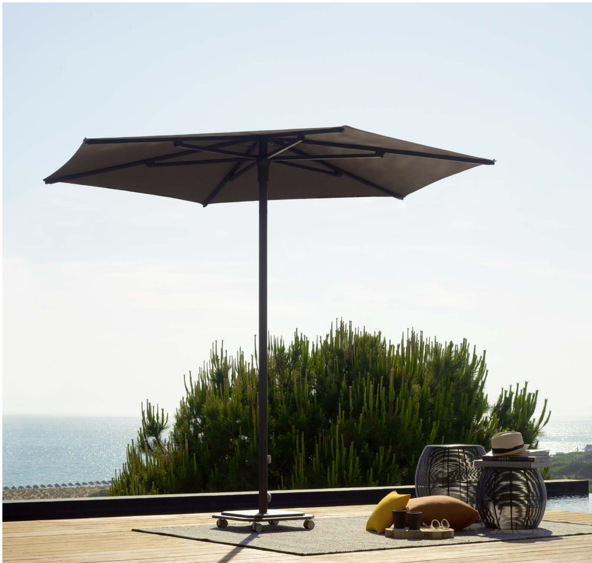
JCP.103 | ø 275 cm - FRAME Alu Charcoal Matte - CANOPY Natté Carbon Beige