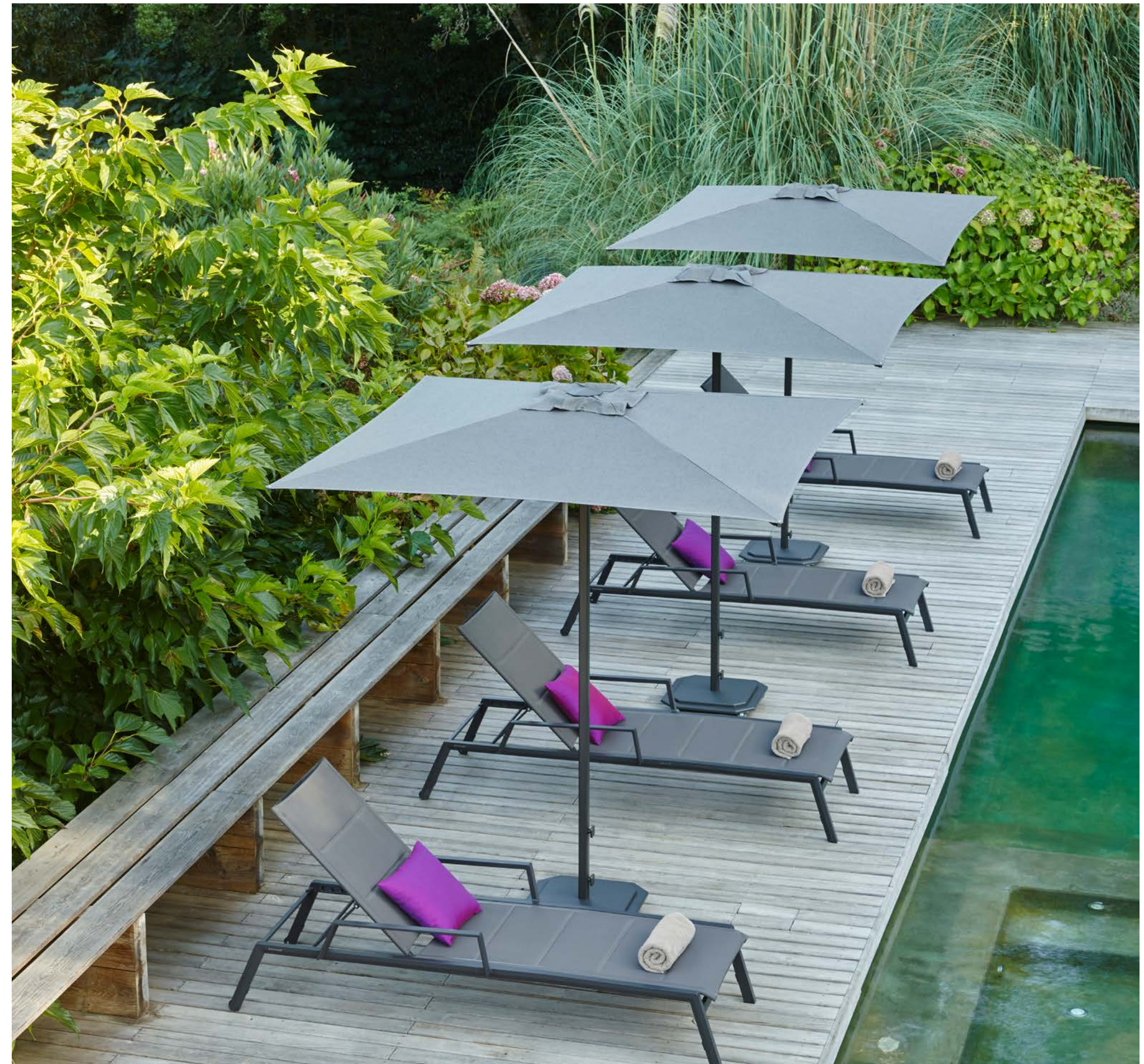
JCP.101 | 200 x 200 cm - FRAME Alu Charcoal Matte - CANOPY Natté Dark Taupe