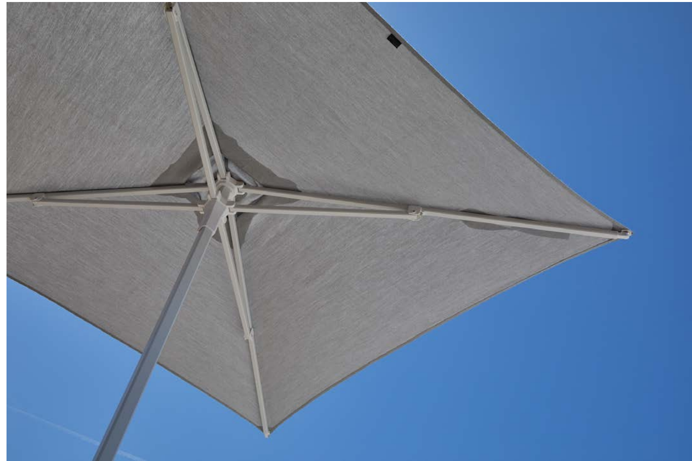
JCP.101 | 200 x 200 cm - FRAME Alu White Matte - CANOPY Natté Grey Chiné