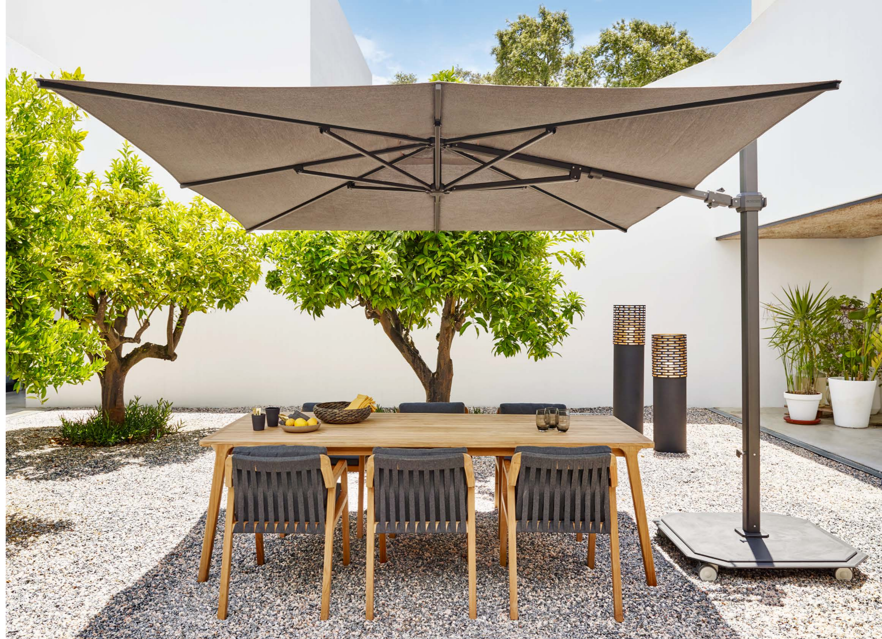
JCP.301 | 300 x 300 cm - FRAME Alu Charcoal - CANOPY Natté Dark Taupe