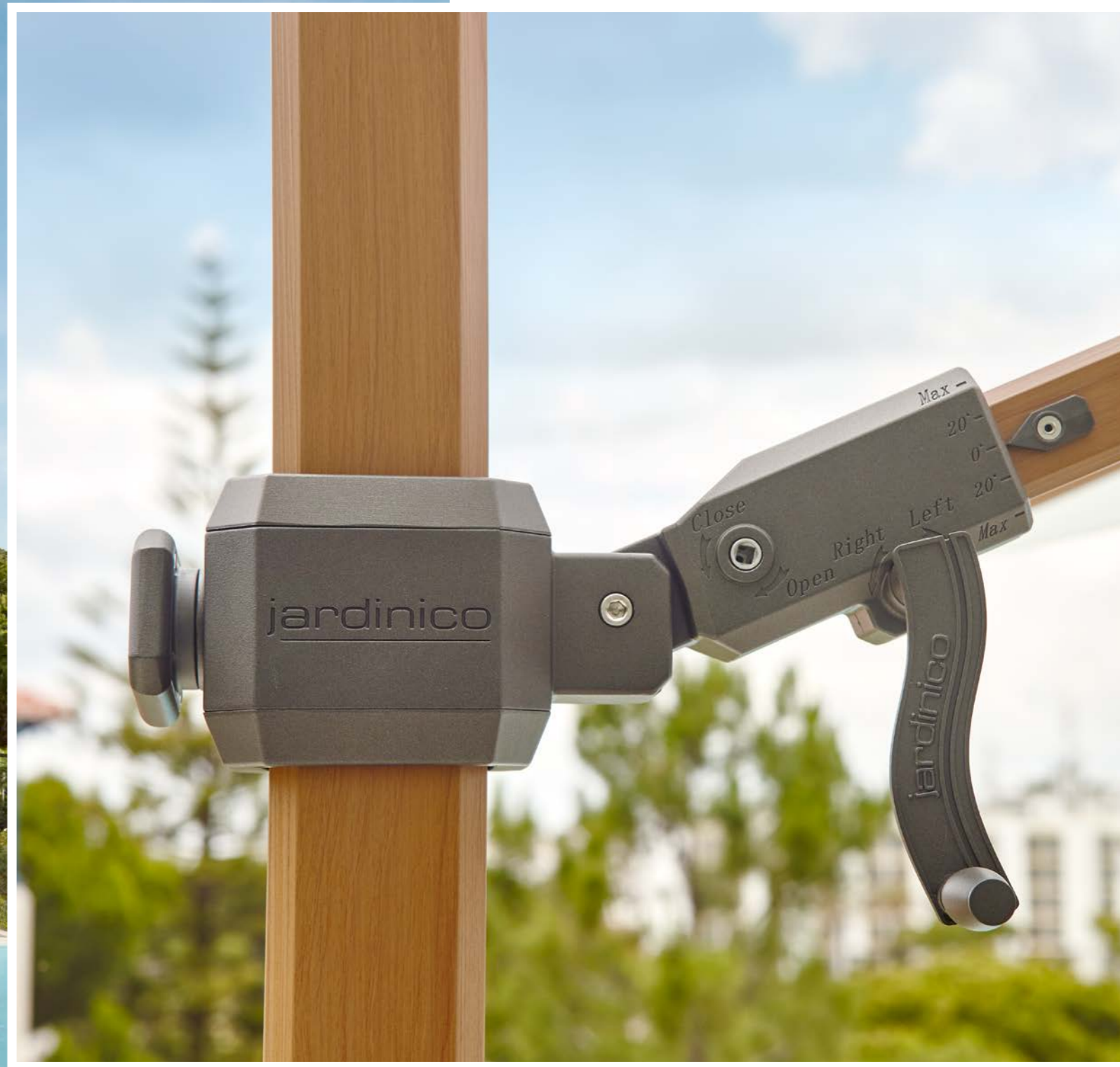
JCP.301 | 300 x 300 cm - FRAME Alu Teak - CANOPY Natté Dark Taupe