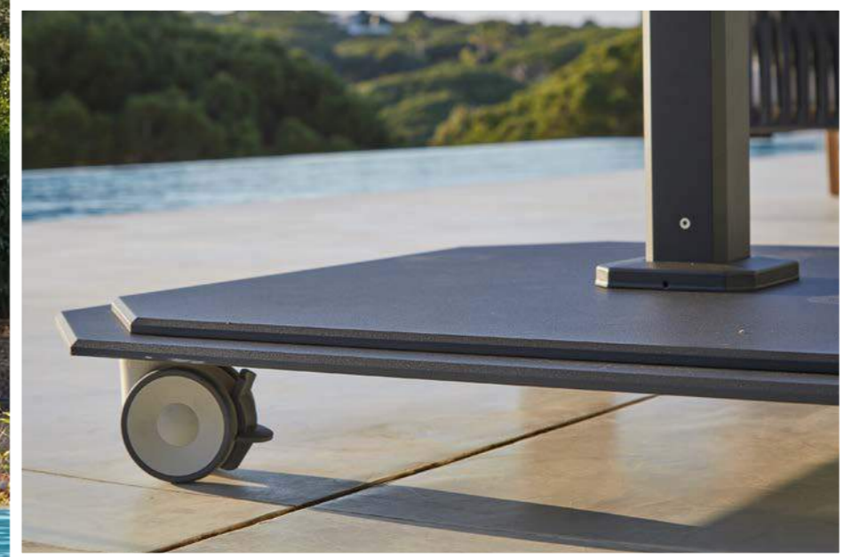
JCP.301 | 300 x 300 cm - FRAME Alu Anthracite - CANOPY Natté Grey Chiné