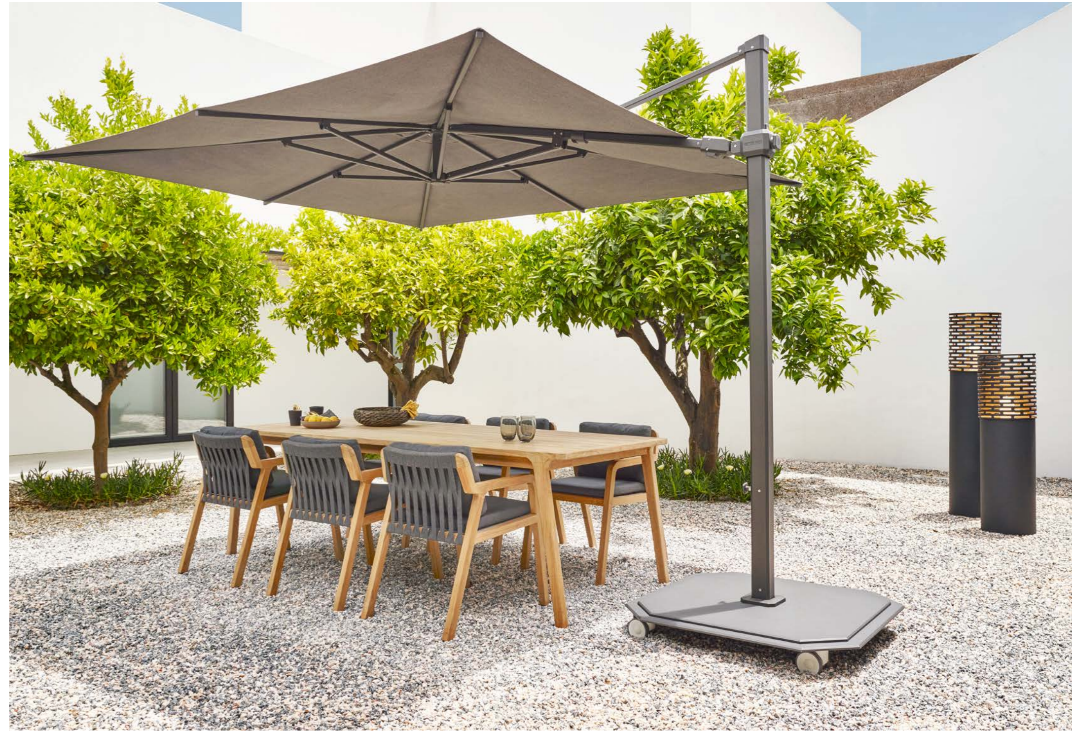
JCP.301 | 300 x 300 cm - FRAME Alu Charcoal - CANOPY Natté Dark Taupe