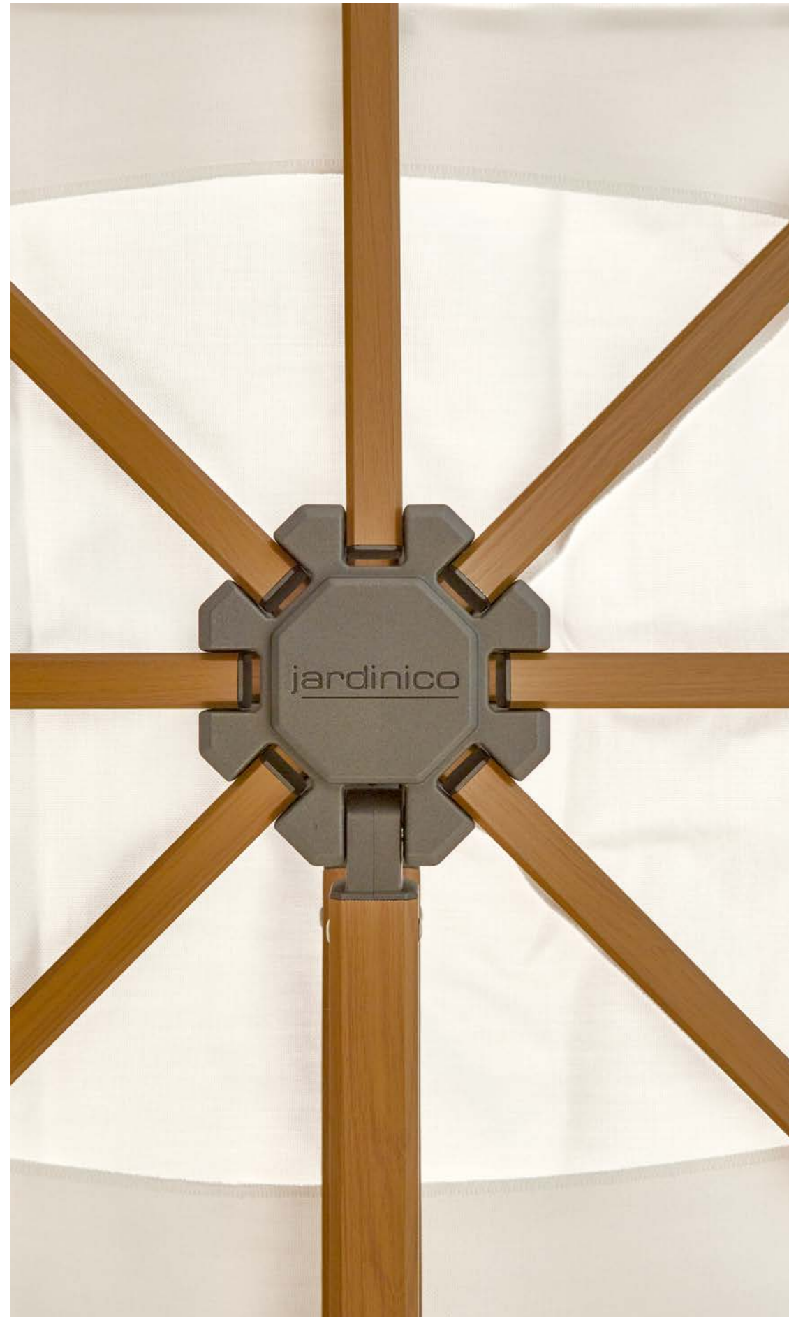
JCP.301 | 300 x 300 cm - FRAME Alu Teak - CANOPY Natté White