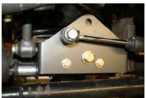
Figure 7-1 Figure 7-2