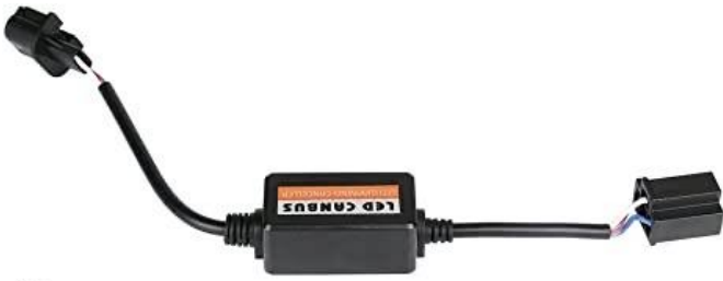
Anti-Flicker Harness (purchased separately)