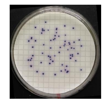
Ambient light at 16 hr Blue-purple (Chromogenic color) E.coli

12.2. Use the following general formula to calculate the E. coli count per 100 mL of sample.