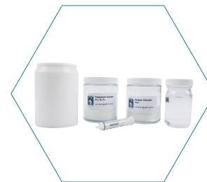
Oosafe® VOC-Log Calibration Kit For Humidity (RH) OOVOC-L04