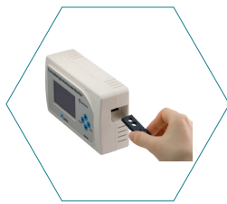
Detachable Sensor Cartridge