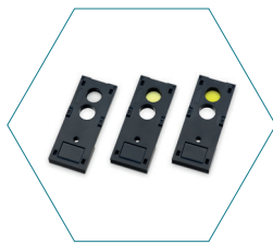
Colorimetric reaction to exposure