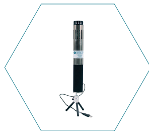
Oosafe® VOC-Log HIGH HUMIDITY with O 2 sensor OOVOC-L07