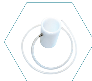
Oosafe® VOC-Log Calibration Hood OOVOC-L05