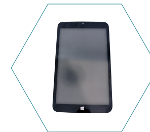
10" Tablet for Oosafe® VOC-Log and Air Quality Control System OOVOC-TABW8-02