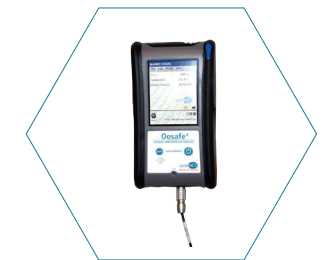
Oosafe® Analyzer with WolfSense Software OOANA-W01