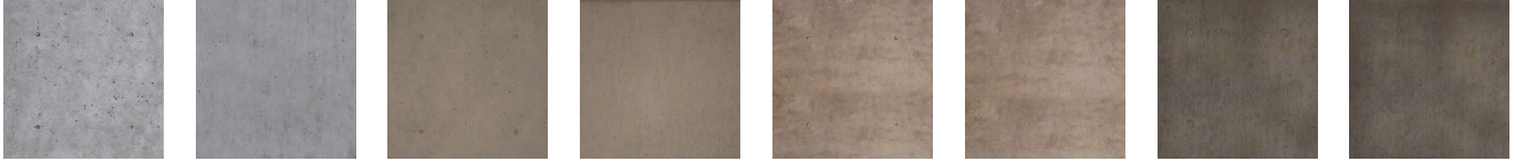
Industrial Grey 'Circles' Industrial Grey 'Flat' Washed Grey 'Circles' Washed Grey 'Flat' Rustic Grey 'Circles' Rustic Grey 'Flat' Onyx Grey 'Circles' Onyx Grey 'Flat'