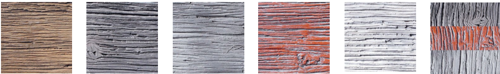
Worn Leather Aged Elm Weathered Grey Barn Red White Wash Random Blend (Weathered Grey, Barn Red, Aged Elm Combo)