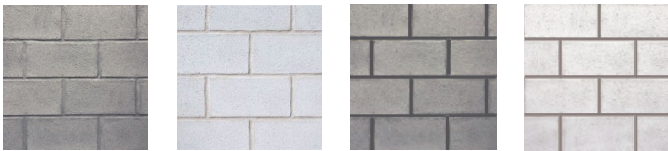
Traditional Washed Grey Traditional Industrial Grey Modern Washed Grey Modern Industrial Grey