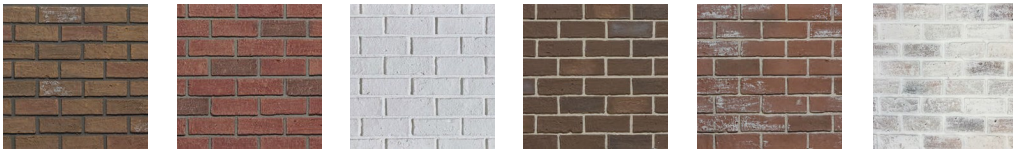
Antique Old Italy Vintage White Cellar Brown Reclaimed Red Lime Wash