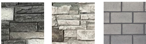
Iron Black Mountain Summit Vintage White