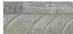
The ISH Collection