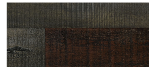
The SMOOTH Collection