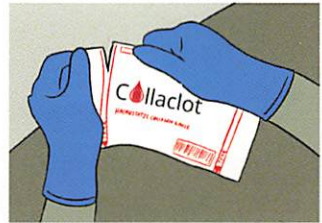
3. Remove CollaClot™ Haemostatic Sponge from packet.