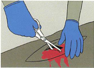
1. Identify / Expose the wound.

Please refer to the instructions below to ensure successful application of CollaClot™ Haemostatic Sponge