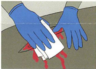
4. Wipe away excess blood where possible.