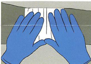
7. Wrap with a bandage to maintain pressure and seek further veterinary assistance where required.

8. Following use and where possible, excess CollaClot should be removed from the wound site. However, as a naturally occurring product (collagen) it will slowly be absorbed by the body.