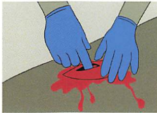
2. Identify the point of bleeding.