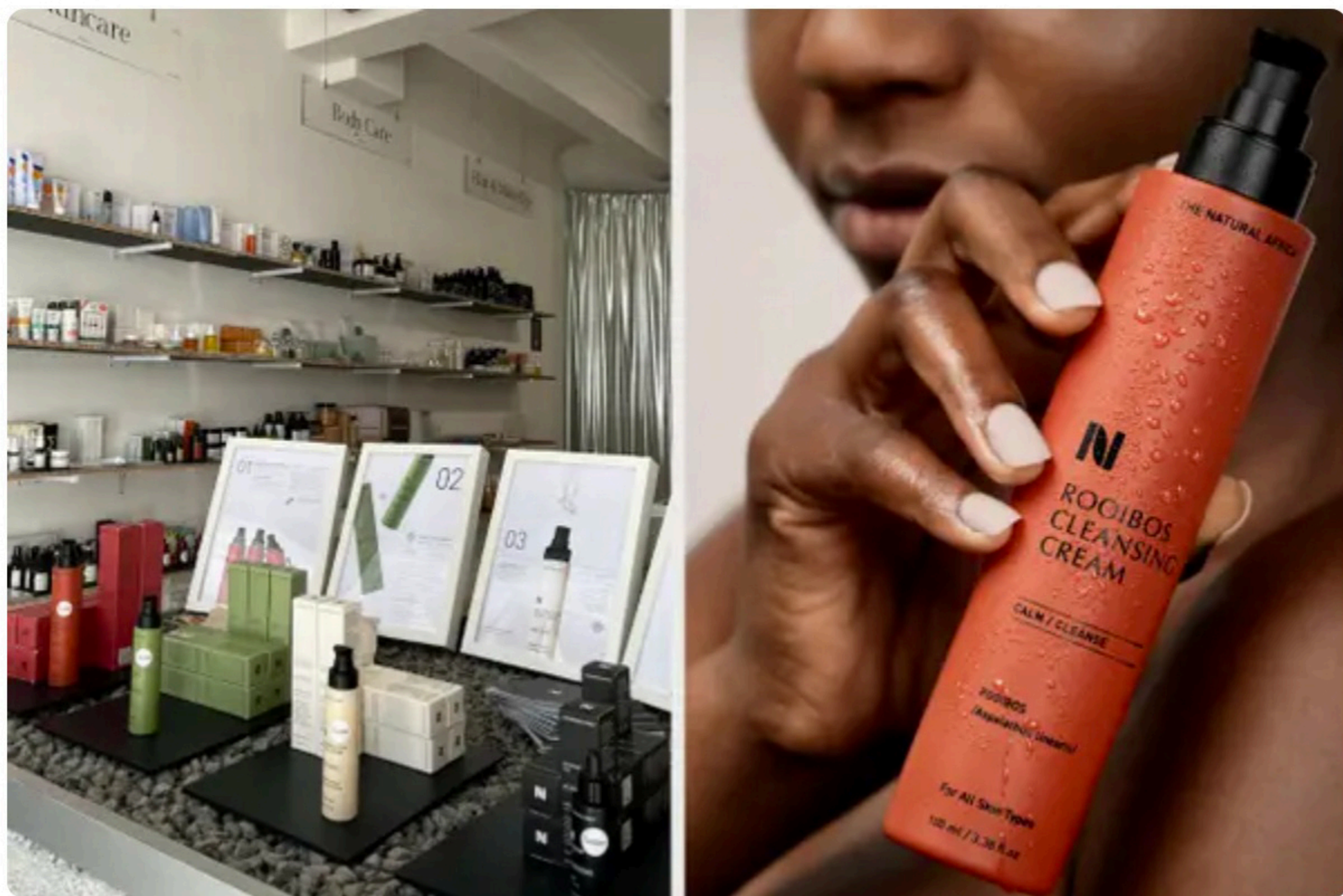
The Natural Africa