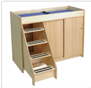
Left side stair version