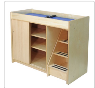
Stairs fully retract