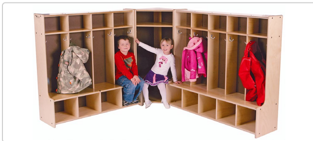
Multiple cubby units fit together perfectly