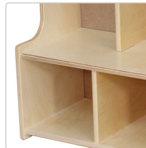
Rounded wood corners with built-in seats