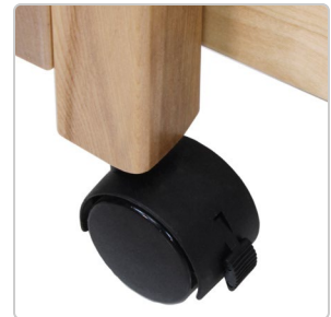
2" lockable casters on the S341 model