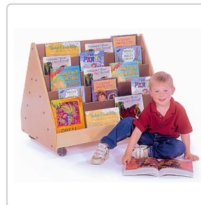
S323 is double-sided