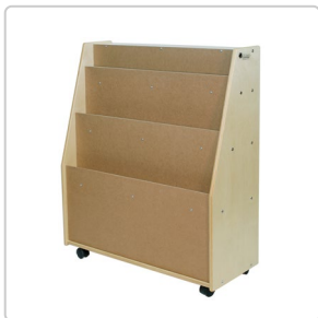
S329 includes a rear shelf