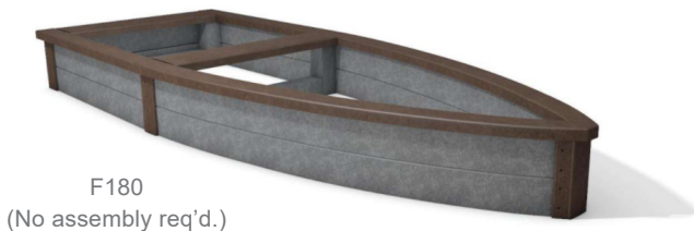
F180 (No assembly req'd.)