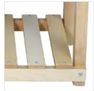
Slatted bottom shelf