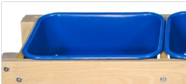
Two large, framed, plastic bins are included.