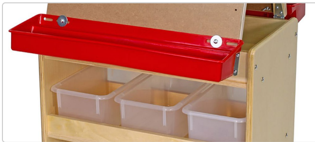
Large red trays and generous bin storage (D212, D214)