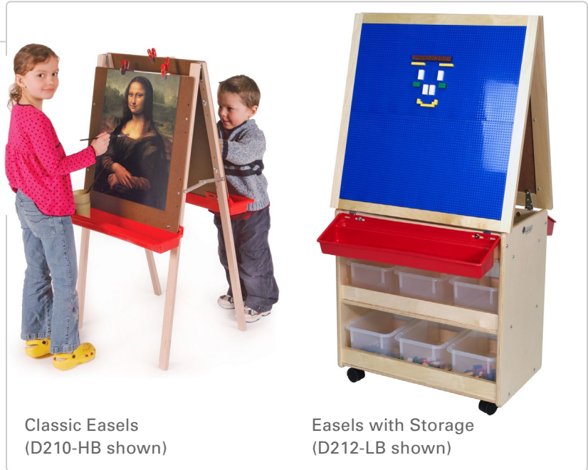
Classic Easels (D210-HB shown)

Light assembly required. FSC certified. Made in Canada.