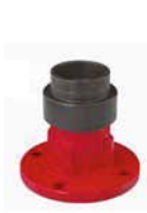
Style 190 Direct Mount Flange