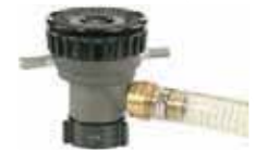
Style 888 Self-Educating Nozzle (750 GPM)

sales @protekfire.com.tw • www.protekfire.com.tw