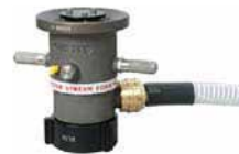
Style 887 Self-Educating Nozzle (500 GPM)