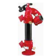
Style 656 shown with Style 622 monitor liftoff