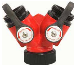
Style 505, 506 Forestry Wyes