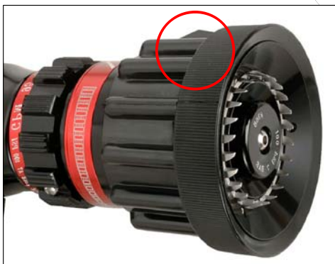
Raised lug for flashover fog pattern