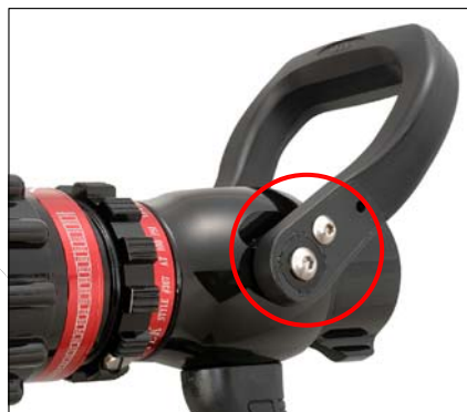
Newly improved handle with two reinforced pieces on each side to prevent breakage