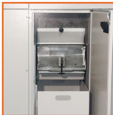
Easy access to cutting units and waste container