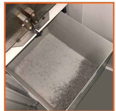
Easy removal and emptying of waste container