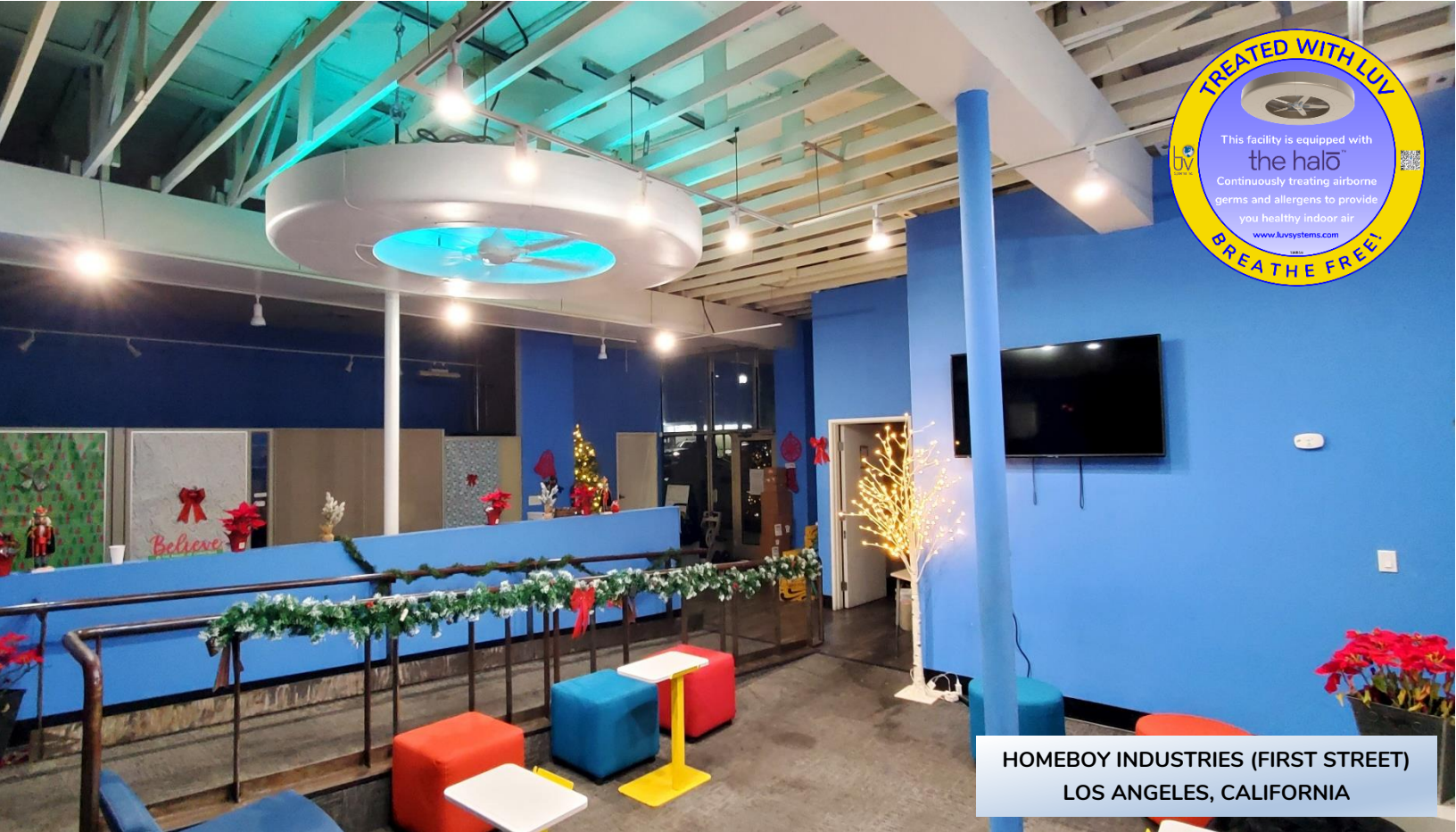
HOMEBOY INDUSTRIES (FIRST STREET) LOS ANGELES, CALIFORNIA