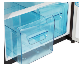
4 glass shelves 2 crisper drawers