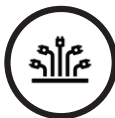
Installation with Color-Coding