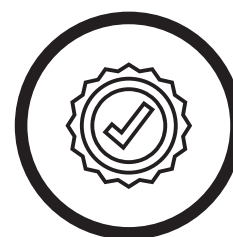
IP67 Waterproof Rating