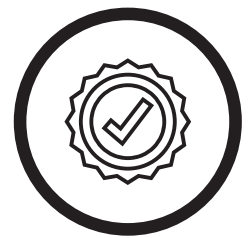
IP67 Waterproof Rating