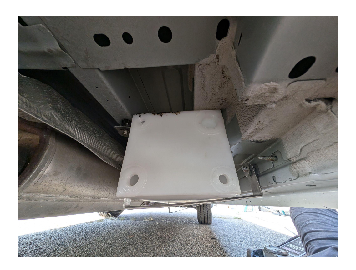
STEP 6 : Install water tank and bend back the heat shield.