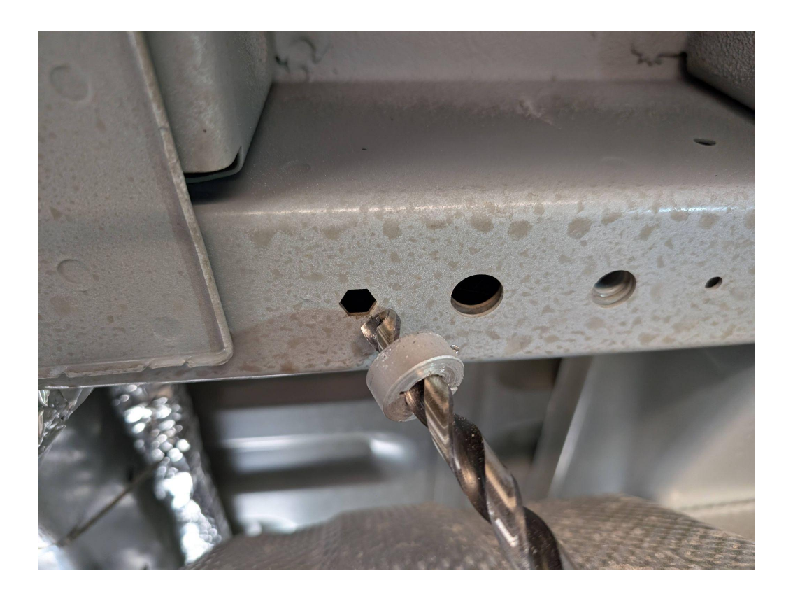
STEP 3 : Use an 11mm or 7/16" metal drill-bit to enlarge the hole to the correct size for the riv-nut (the Hex works well for the rear strapping).