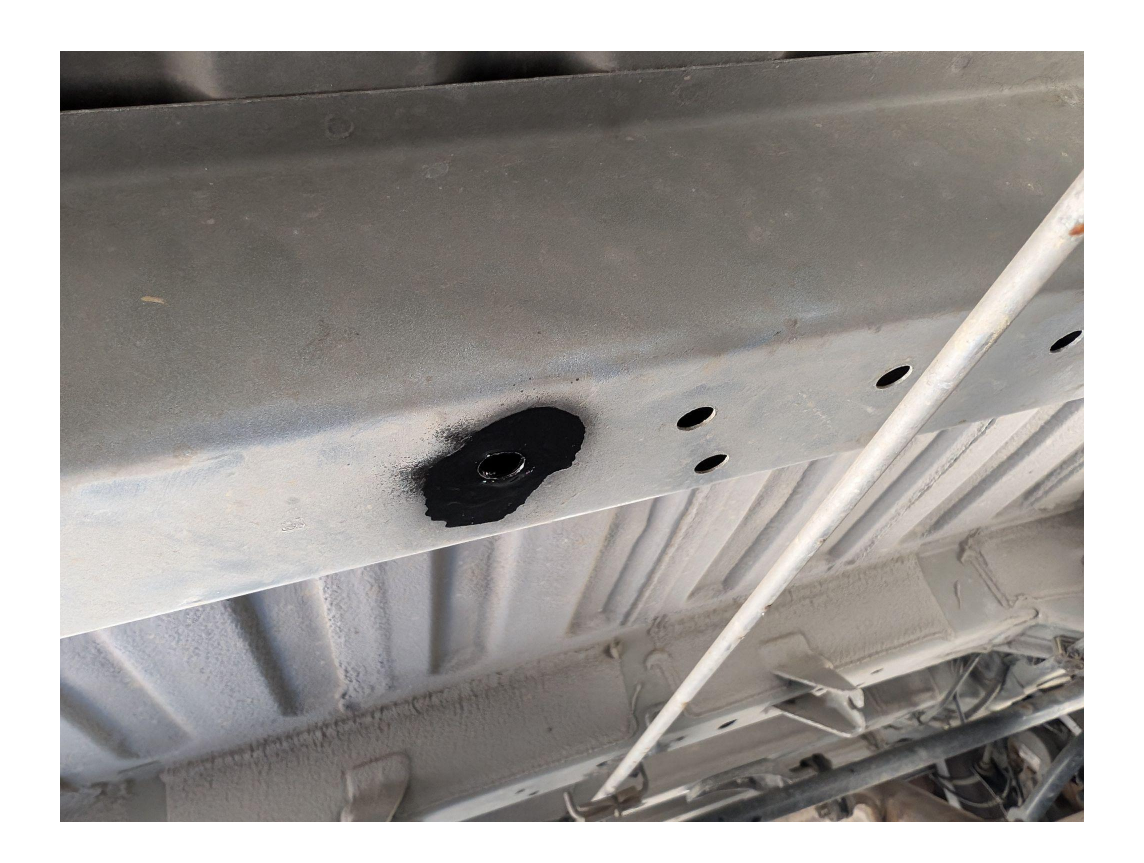
STEP 4 : Spray paint drill holes to seal the exposed metal.