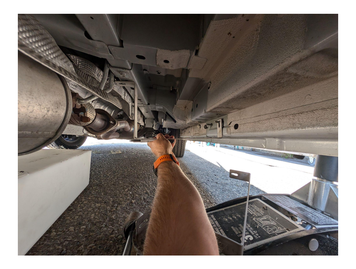
STEP 2 : Find placement of strapping for top riv-nuts using the center most 8mm factory studs.