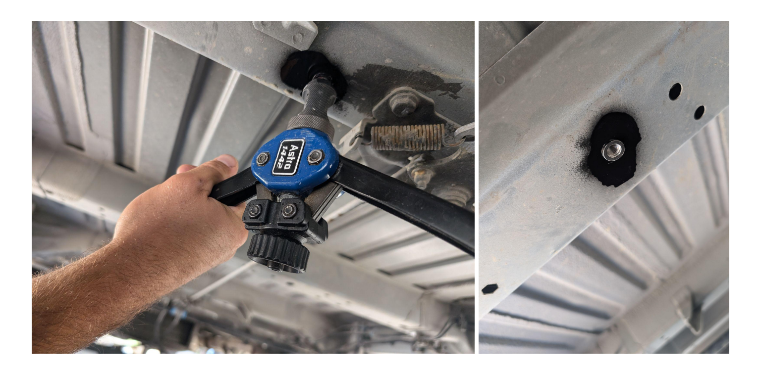
STEP 5 : Install Riv-nuts.