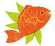
The tusks of the fish called "sea bream" are used to polish to make a gold luster.