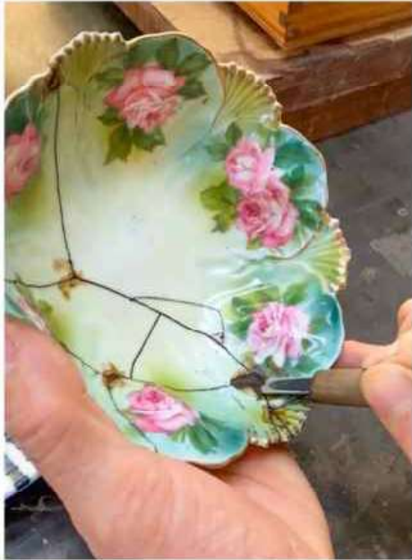
After drying, the excess is scraped off.