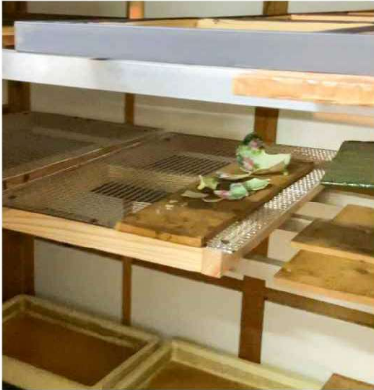
Dry in a dedicated room