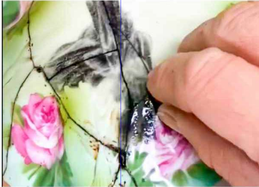
The fine portions are scraped off with a special soft charcoal for lacquering.