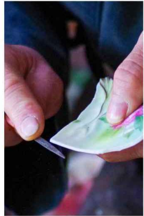
Sand all pieces in the same way.