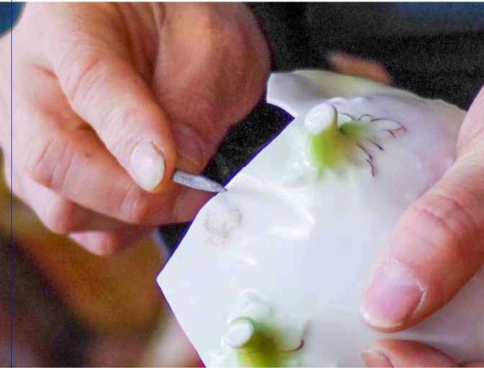
Flatten the cross section of the broken piece with a metal file.