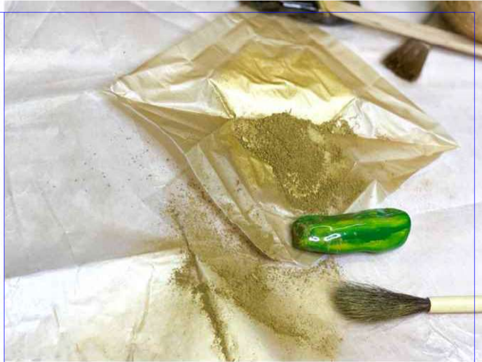
This is 24-karat gold in powder form.