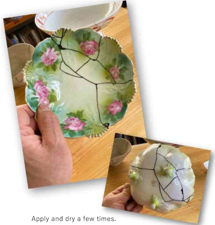
Apply and dry a few times.