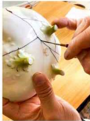
Primer coat of urushi to fix gold powder flat and evenly in the final step.