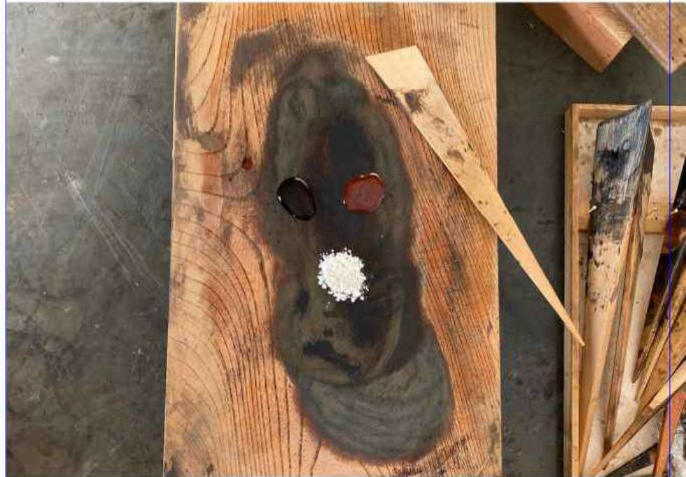
These materials are water, Japanese natural lacquer and wheat flour. These are mixed and used to join the pieces together.