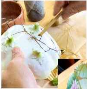
Sprinkling gold powder over the joined part.