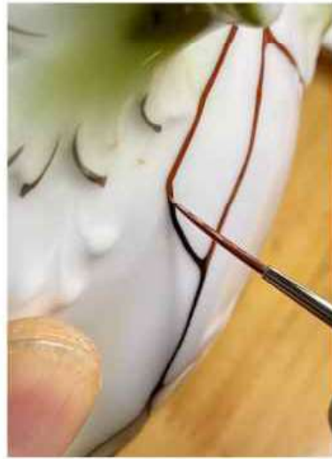
Intermediate coat of urushi just before sprinkling gold powder