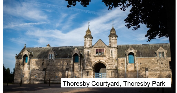
Thoresby Courtyard, Thoresby Park