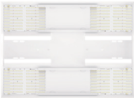
HLG 700 Rspec FR Lamp