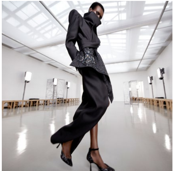
ArdAzAei Couture 2024.