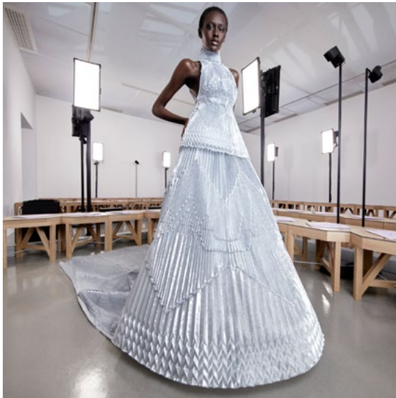
ArdAzAei Couture 2024.