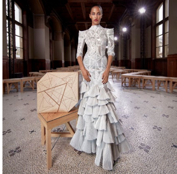
ArdAzAei Couture 2023.