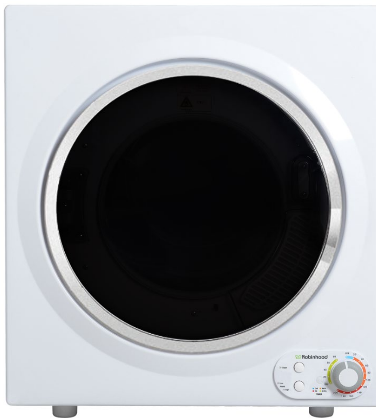
Model pictured: RHVD45UDW