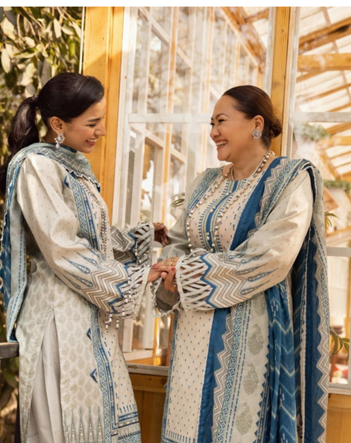
EZS-L3-07-03 | 3 PC Digital Printed Lawn Shirt with Digital Printed Self Jacquard Lawn Dupatta. Dyed Cambric Trouser.