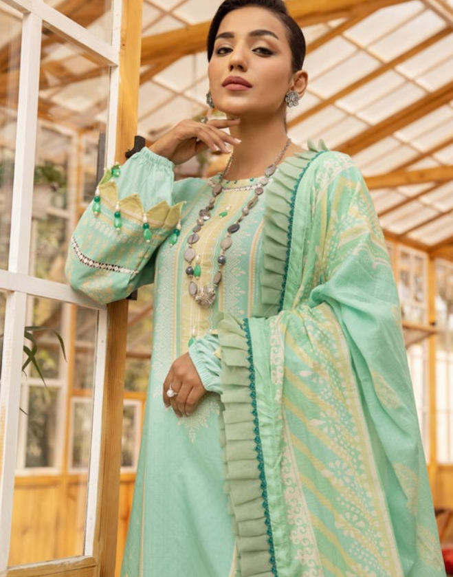
EZS-L3-07-05 | 3 PC Digital Printed Lawn Shirt with Digital Printed Self Jacquard Lawn Dupatta. Dyed Cambric Trouser.