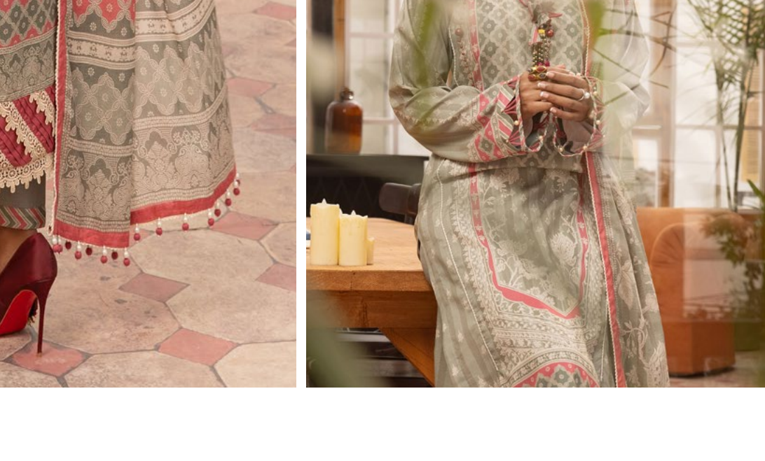
EZS-L3-07-02 | 3 PC Digital Printed Lawn Shirt with Digital Printed Self Jacquard Lawn Dupatta. Dyed Cambric Trouser.