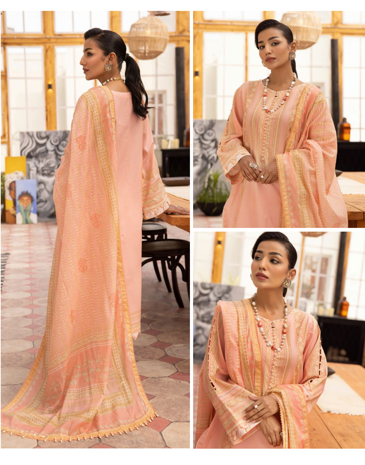
EZS-L3-07-06 | 3 PC Digital Printed Lawn Shirt with Digital Printed Self Jacquard Lawn Dupatta. Dyed Cambric Trouser.