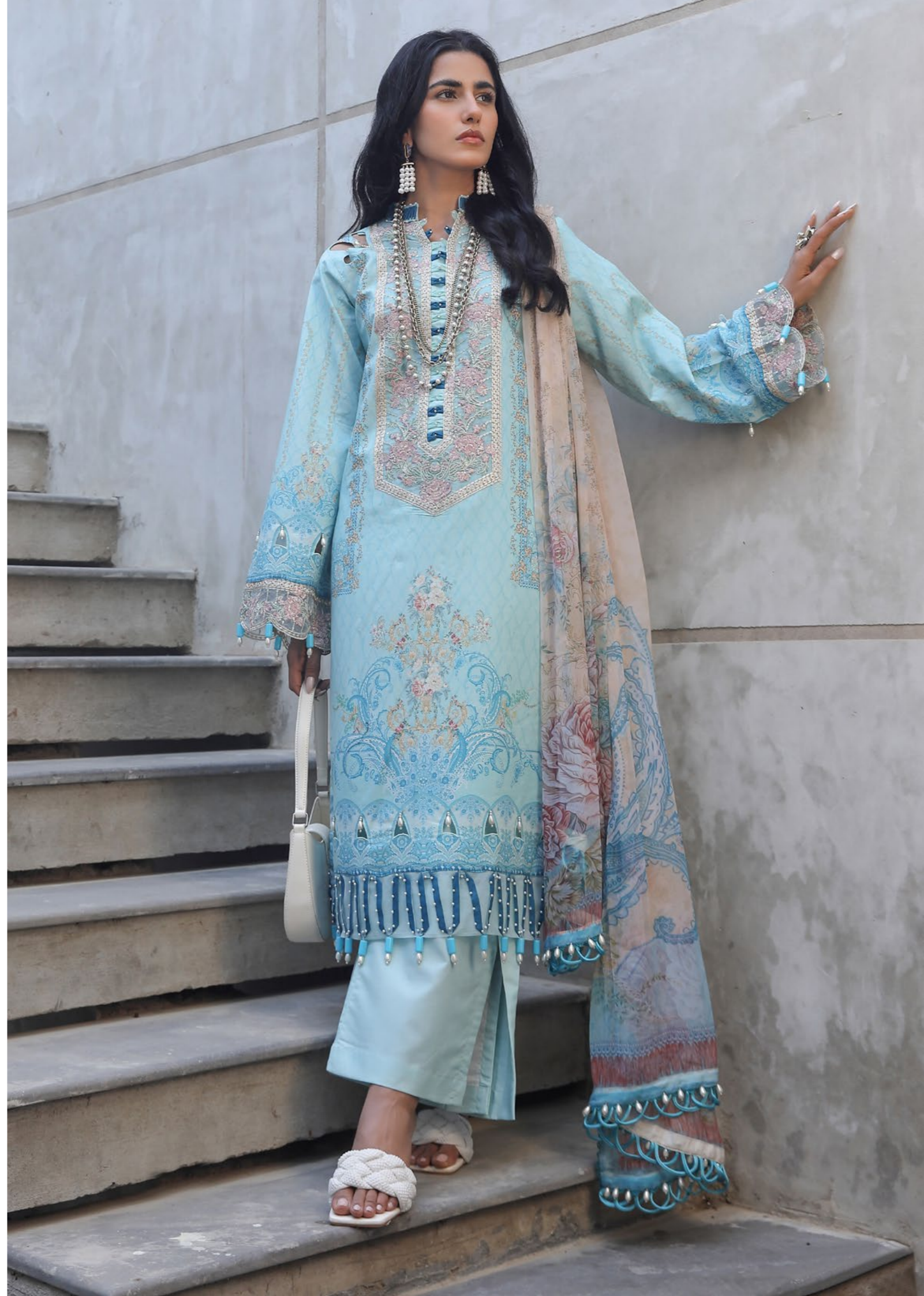
EZS-L3-01-10 | 3 PC Digital Printed Lawn Shirt with Embroidered Neckline Organza and Embroidered Border Organza. Digital Printed Chiffon Dupatta paired with Dyed Cambric Trousers.